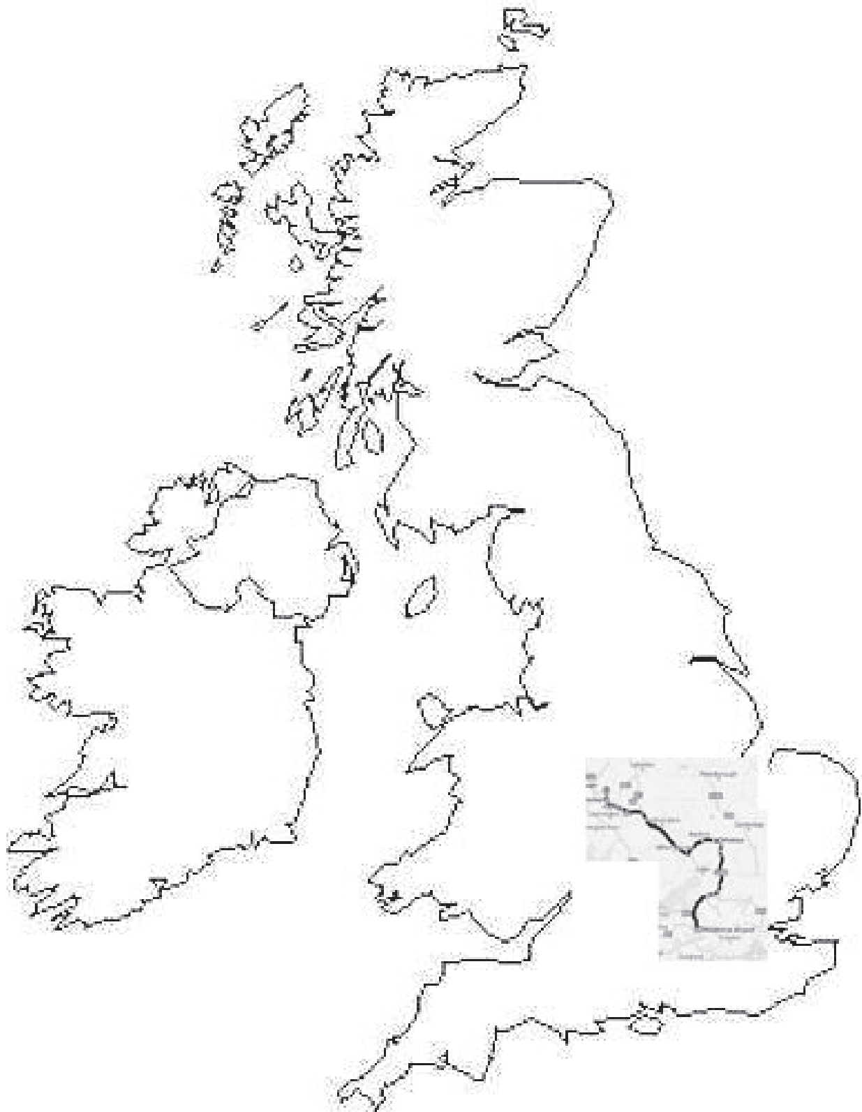
Visits to England from Canada – 2006 and up.